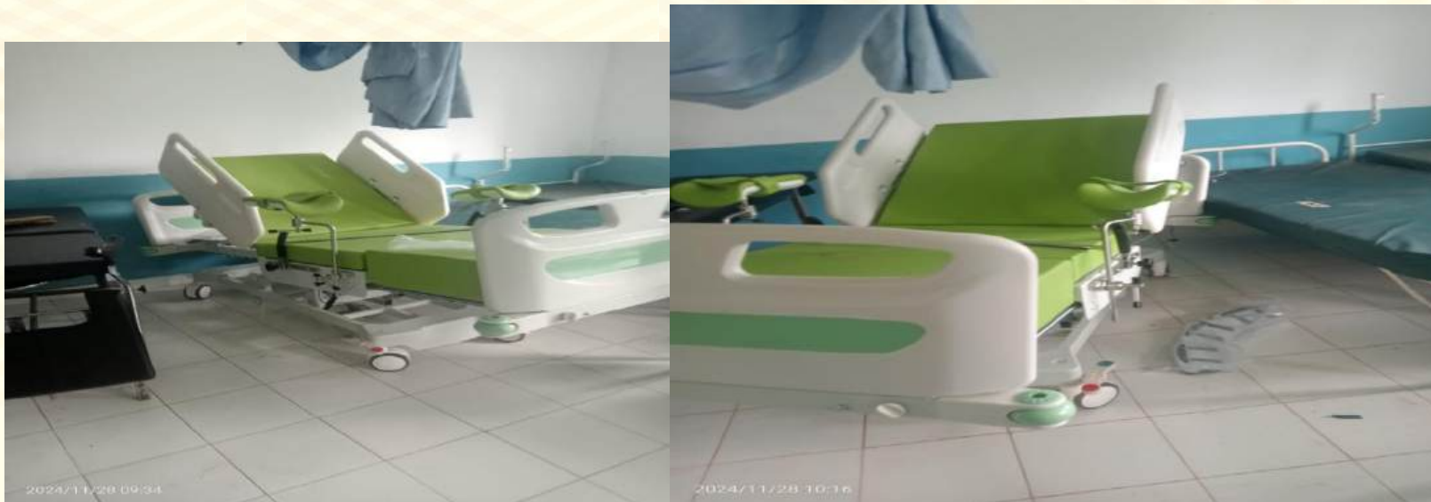
Fig. 2: Delivery beds for Nguni health centre and Tseikuru sub-county hospitals