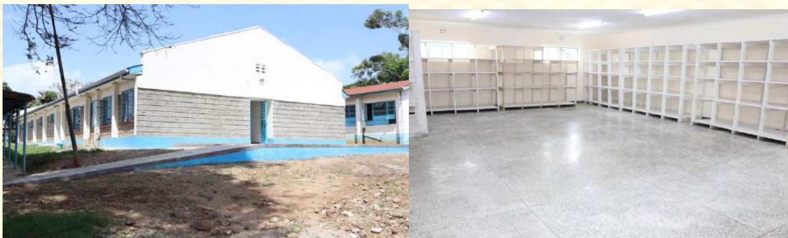
Fig. 3: Completion and equipping of a medical store at KCRH