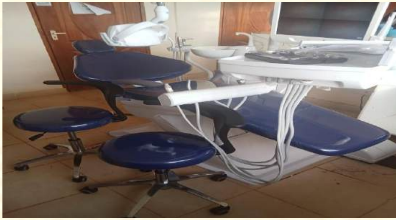
Fig. 1: Dental chair for Kitui County Referral Hospital