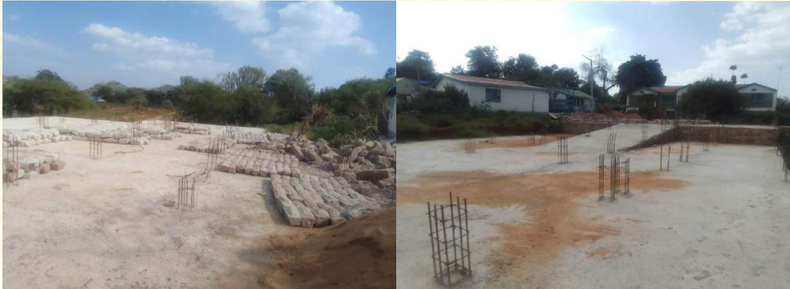
Fig. 4 Continuation of Construction of medical/female ward at Mwingi Level IV hospital