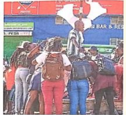
Shoppers look through second-hand clothes at Gikomba Market in Nairobi on February 4. A new survey shows half of Kenyans are suffering financial stress.

The financial stress could be brewing a significant health crisis in the country with over two-thirds of those feeling highly or overwhelmingly stressed by their financial situation saying the stress is taking a toll on their