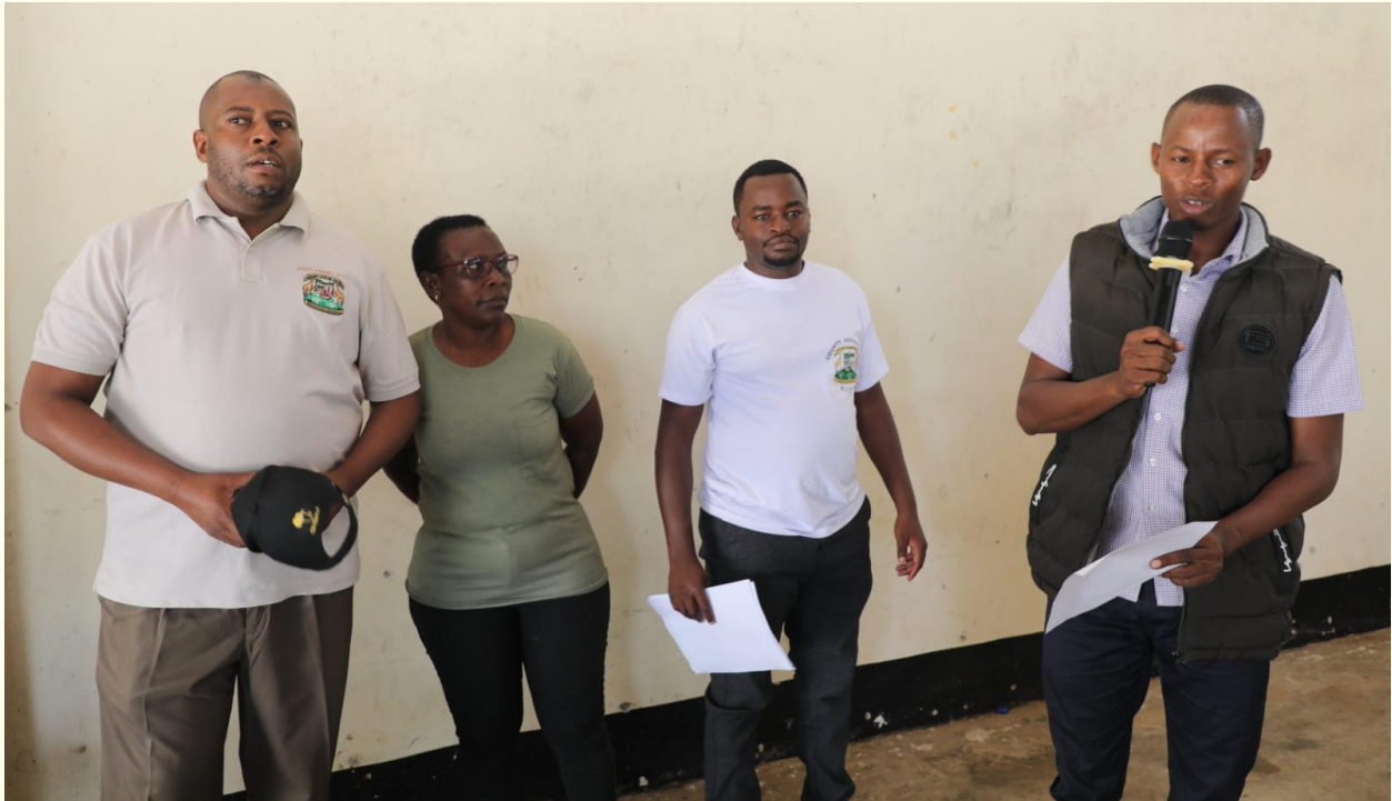
Picture 5: Members of the County Assembly Present Introducing themselves